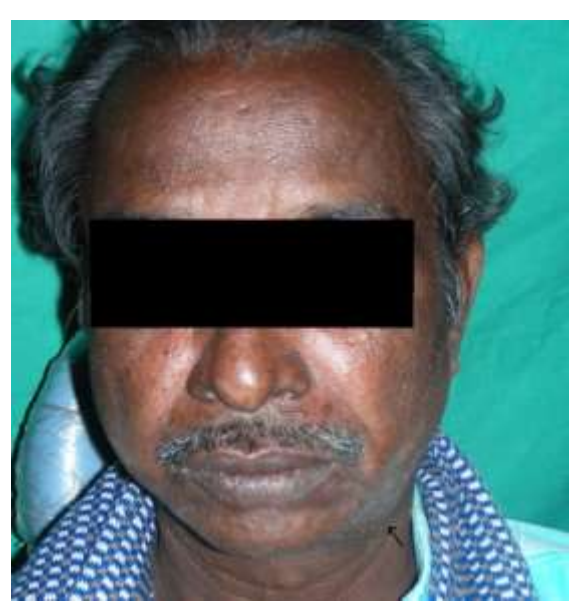
Figure 1: Patient photograph showing swelling in the left submandibular area